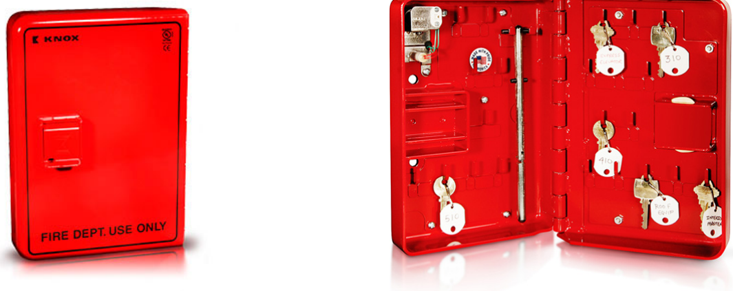
Knox 1400 Series with Door Drop Key & Key Storage

The Knox - Emergency Access Cabinet to be installed in each elevator lobby on the first floor, 6 feet to the top of the box above finished grade.