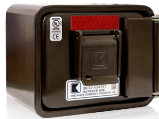
Knox Box 3200 Series Flush Mount