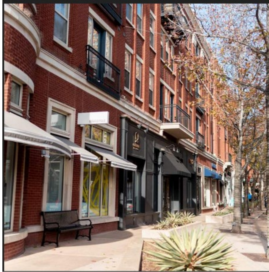
West Village, Dallas