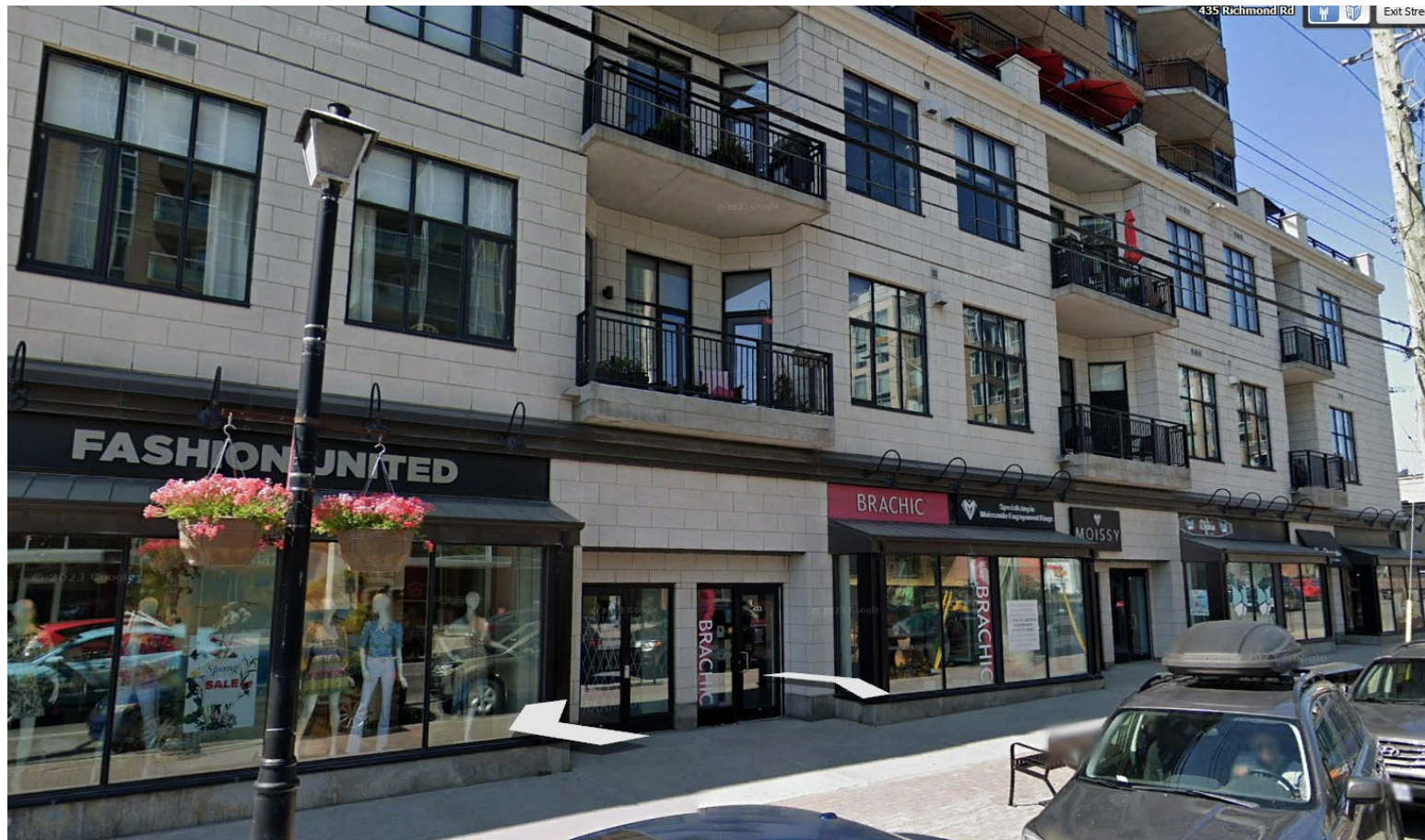
Westboro Village, Ottawa