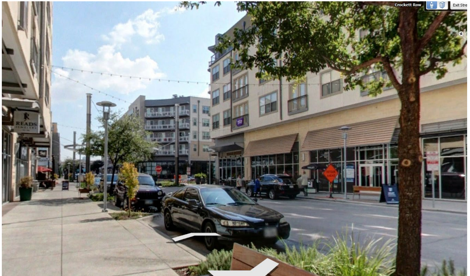
West 7 th , Fort Worth